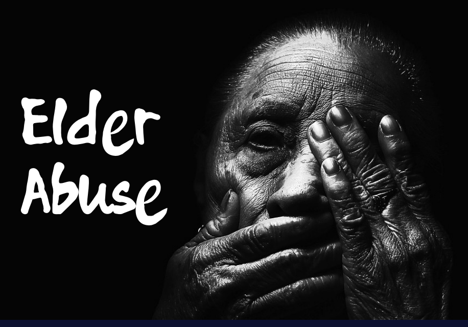
If you have been the victim of abuse, exploitation, or neglect, you are not alone. 1 in 10 seniors in New York report being abused.